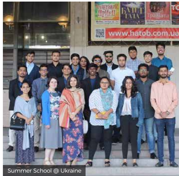
Summer School @ Ukraine

Students of School of Law attended a Summer School Programme in Ukraine and Poland organized in association with Ukrainian Ministry of Education. Topics covered were on history and culture of the two countries pre and post-Soviet period, integration of European Union, public international law, politics and the role of mass media, and on the economy of Ukraine.